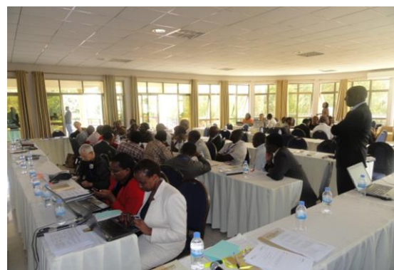
Launch of Privileged Access to CAB Abstracts and CABI Compendia