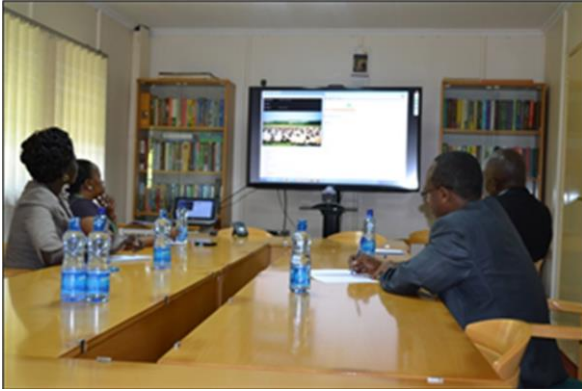
RUFORUM librarians from Kenya participating in the webinar sessions