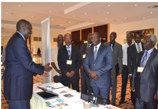
David Onyango explains the CABI-RUFORUM collaboration to Rwanda's Prime Minister Rt Hon Dr Pierre Damien HABUMUREMYI at the RUFORUM AGM exhibition

DO attended RUFORUM's 9 th Annual General Meeting (AGM) for the launch of privileged access to CAB Abstracts database and Compendia in September 2013. This represented the first step of CABI and RUFORUM's overall objective of strengthening tertiary agricultural education in Africa. The theme focused on "Sustaining and Mobilizing RUFORUM Universities for Effective Engagement in Agricultural Development and Transformation in Africa". The meeting was officially opened by Rwanda's Prime Minister, the Rt. Hon. Pierre Damien Habumuremyi at Serena Hotel. The launch occurred during the Principals and Dean's committee pre-AGM meeting (an organ of the RUFORUM Governance Structure comprising of Principals and Deans of Colleges / Faculties of Agriculture and related sciences participating in RUFORUM's activities), and was attended by 32 participants from the different universities. DO outlined the objectives and benefits of the collaboration to the universities. CABI also participated in the RUFORUM exhibition at Serena Hotel alongside the National University of Rwanda, Makerere University, University of Nairobi, University of Swaziland, and Bunda College-University of Malawi in showcasing their innovations and partnership initiatives. The author visited the National University of Rwanda (NUR) and held deliberations with Dr Solange Uwituze- Dean, faculty of agriculture and trained the NUR librarians on features and searching of the CAB Abstracts database and Compendia.