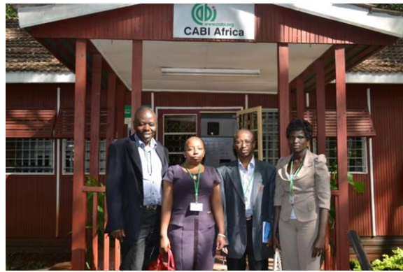
Group photo of the participants