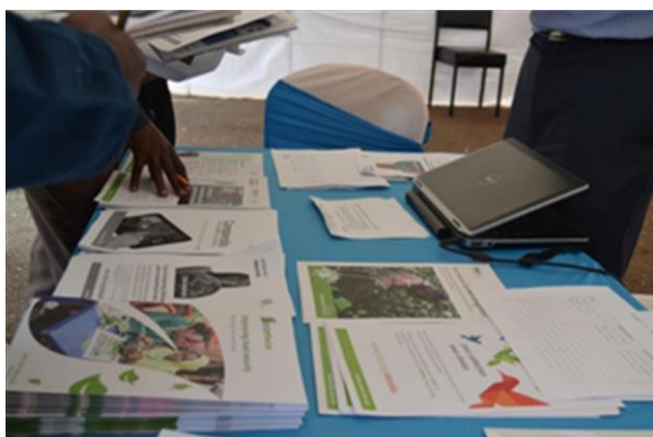
The CABI exhibiting table at the UON Library Open Day/Week

The Open Access Week now in its sixth year is a global event held each year in the month of October. The event offers an opportunity for the academic and research community to continue to learn about the potential benefits of Open Access, to share what they've learned with colleagues, and to help inspire wider participation in helping to make Open Access a new norm in scholarship and research. This year the University of Nairobi (Member University of the RUFORUM Consortium) set up an exhibition, showcasing UoN's information resources including its e-resources and training on various issues such as open access, plagiarism, copyright, searching strategies and e-resources. CABI was invited to participate in the event to showcase its publishing online products (CAB Abstracts and CABI Compendia) currently being provided to the university under the CABI-RUFORUM collaboration. One of the challenges the UoN library faces is underutilization of resources. The event offered the unique opportunity to create awareness, train and increase accessibility to CABI's online information resources.