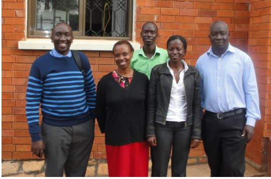
RUFORUM secretariat visit in preparation for the launch of Privileged access