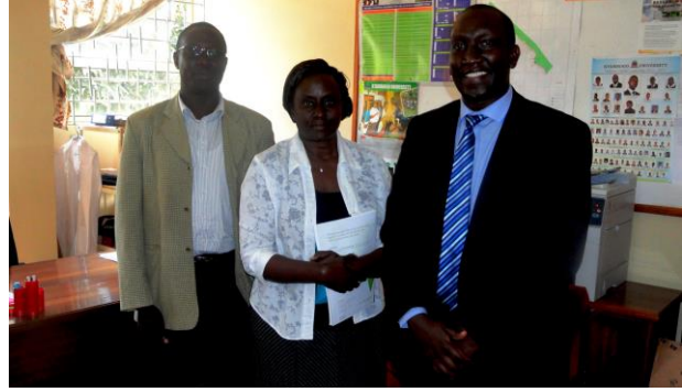
Kyambogo University visit in preparation for the launch of open access to CAB Abstracts database and CABI Compendia to RUFORUM