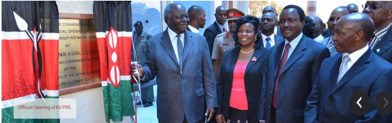
Official Opening of KU PML