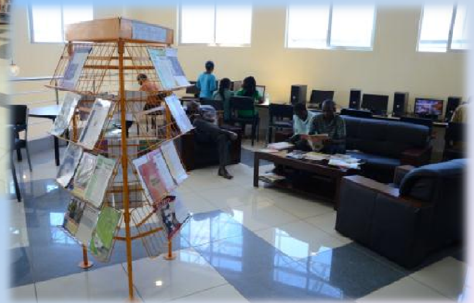
Subject Reading Area