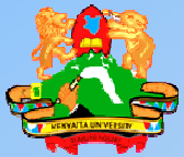
Kenyatta University Post Modern Library