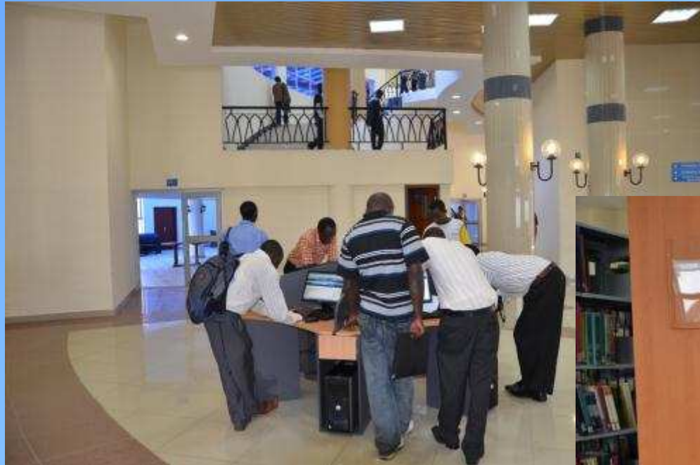
OPAC for Education Students